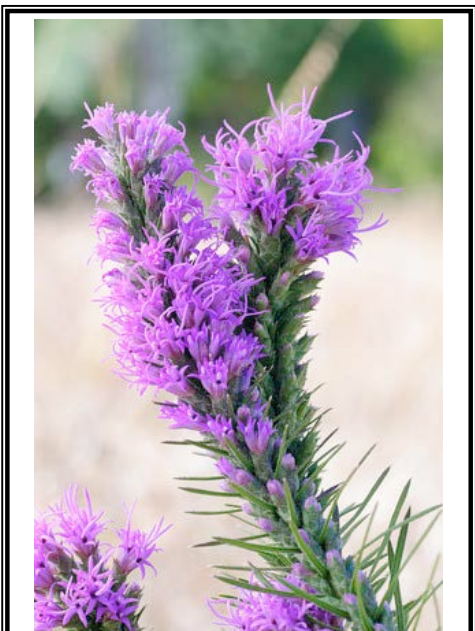
Gayfeather – September 2011